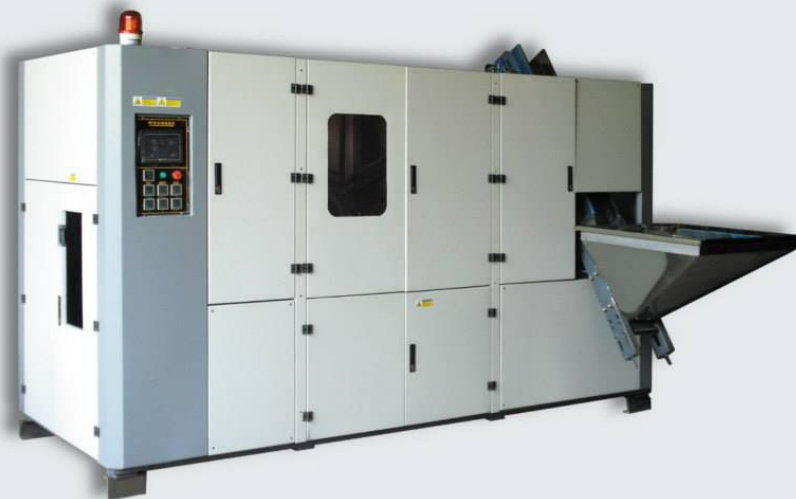
全自动吹瓶机 Automatic Bottle Blowing Machine

Both rotary blow molding and linear blow molding are equipped with the latest technical achievements. So they reduce the bottle blowing cost under the maximum capacity. The capacity are from 1000BPH to 12000BPH which can meet all PET production requirements.