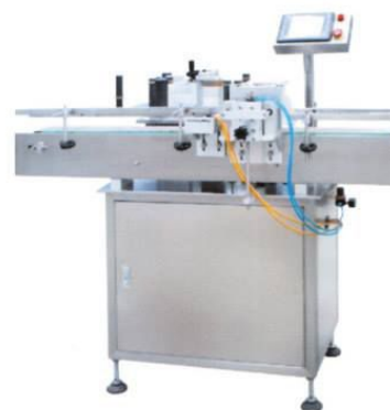
全自动高速圆瓶贴标机 Automatic high-speed round bottle labeling machine