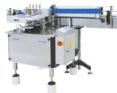
全自动上糊式贴标机 On paste-type automatic labeling machine