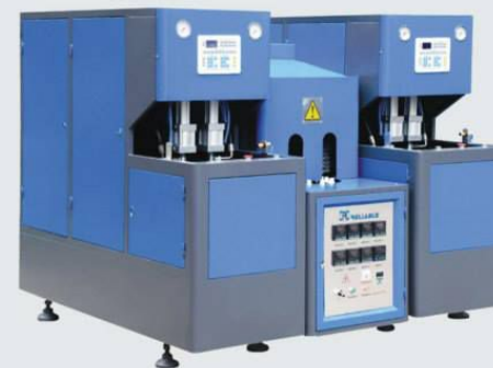
半自动吹瓶机 Semi-Automatic Blowing Machine