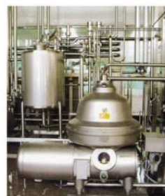
萃取与分离系统 Extraction System