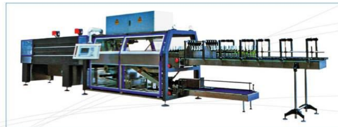
全自动纸箱包装机 Full-automatic carton packaging machine