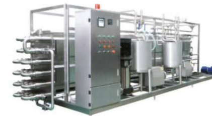
管式UHT Tubular UHT