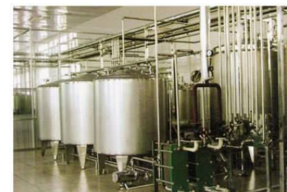
CIP清洗系统 CIP System