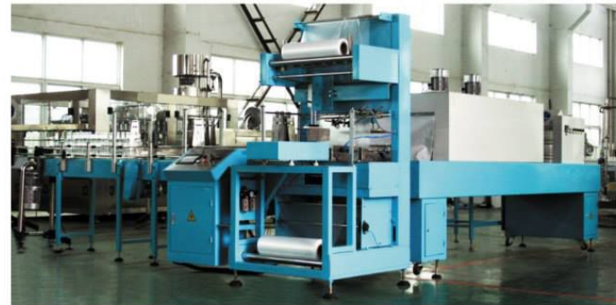
全自动热收缩膜包装机 Full-automatic heat-shrinking film wrapping machine

Specially designed and manufactured for the high speed packing requirements of drinks(pure water,beverage,fruit juice,and milk product)During the product forward conveying process,it can automatically group the product into package,so as to save time and enhance packing efficiency.Touch-screen operating panel with user-friendly interface and convenient parameter setup,absolutely an easy-to-operate machine.The ideal model of middle-speed heat-shrinking package in the domestic market.