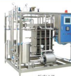
板式UHT Plate UHT